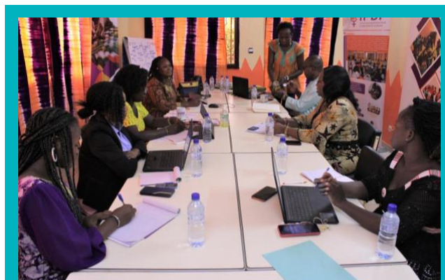
Consultation with the Initiative Pananetugri pour le Bien-être de la Femme in Burkina Faso, November 24, 2022