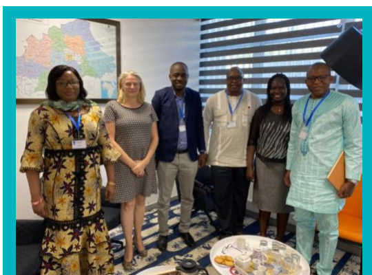
Consultation with the Ambassador of the Netherlands in Burkina Faso, November 24, 2022

* NGOs that have agreed to collaborate with Ensemble.