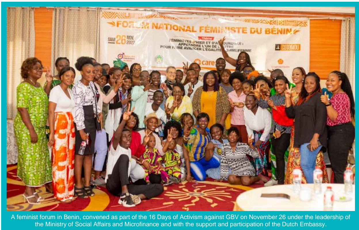
A feminist forum in Benin, convened as part of the 16 Days of Activism against GBV on November 26 under the leadership of the Ministry of Social Affairs and Microfinance and with the support and participation of the Dutch Embassy.

The GBV elimination roadmaps and GBV response services will also inform the development of joint proposals that Ensemble partners will co-develop to mobilize additional resources. Together with our partners, and with additional support from generous institutional funders, Ensemble will generate the momentum and co-create the response necessary to eliminate GBV in West and Central Africa.