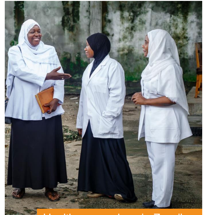
Healthcare workers in Zanzibar

ExpandPAC is strengthening local capacity in policy advocacy and accountability of PAC and comprehensive abortion care (CAC). The project also aims to generate evidence to inform programming, mobilize PAC clients for services, and advocate for an improved environment for PAC and CAC services in Zanzibar.